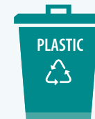
Use & Disposal